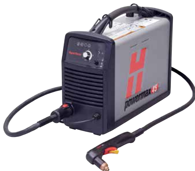
T45v hand torch