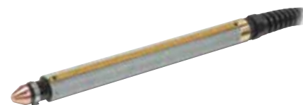
T45m machine torch